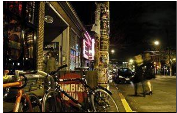
Women dressed in black make their way to Quinn's, past Bimbo's Cantina and the Cha Cha Lounge, the Pike Street newcomers on the street level and downstairs at 1013 E. Pike St.